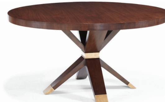
550-16 Zanzibar Dining Table Base ☑

36"W 36"D 29¼"H Walnut veneers / Maple solids Option of Brushed Brass or Brushed Nickel Ferrules