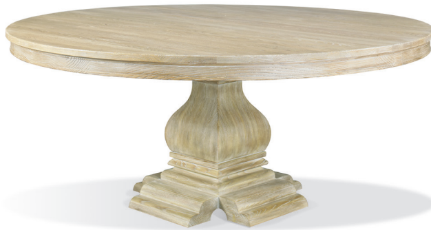
550-05 Baluster Base ☑