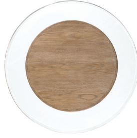
Glass Top with Ash Topper