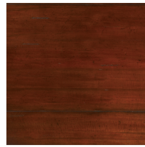
Rectangular Maple Top Options