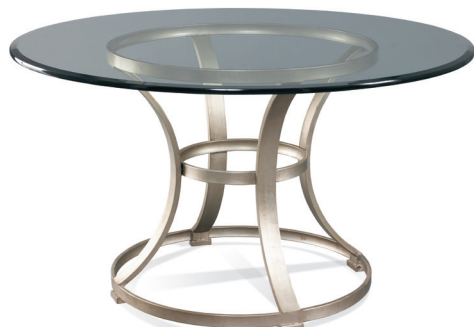
550-11 Everett Dining Table Base

31½"DIA 29½"H Platinum finish Metal Base