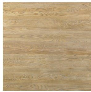
Rectangular Ash Top Options