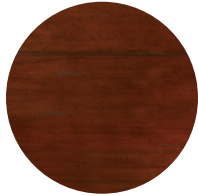
Lazy Susan Maple Top