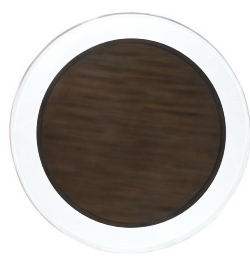
Glass Top with Maple Topper