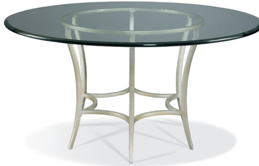
550-09 Sunburst Base