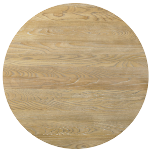
Round Ash Top Options