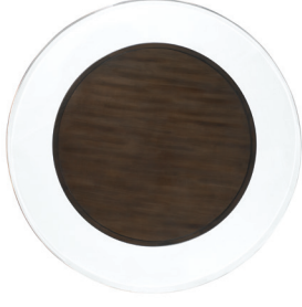
Glass Top with Maple Topper