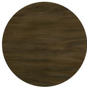
Round Walnut Top Options