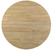
Lazy Susan Ash Top

Designed to lay on top of Dining Table Pedestal Base to allow use of glass top.