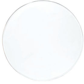
Glass Top with Beveled Edge