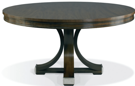
550-03 Celia Pedestal Base ☑

32"W 32"D 29"H Maple solids Nickel hardware standard Antique Brass hardware optional *Not available with 72" Tops