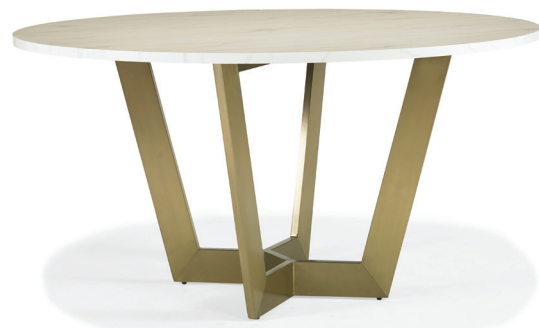
550-07 Marc Base

40¼"W 40¼"D 29¼"H Champagne finish Metal Base *Not available with 72" Tops