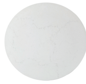
White Quartz Stone Top