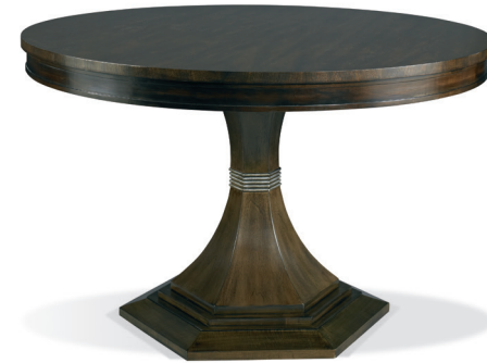
550-06-00 Paxton Base ☑