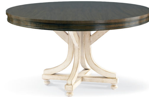
550-10 Leland Base ☑