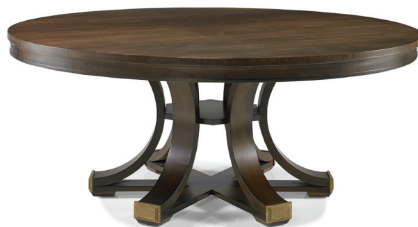
550-14 Caroline Pedestal Base ☑

44"W 44"D 29"H Maple solids Nickel hardware standard, Antique Brass hardware optional