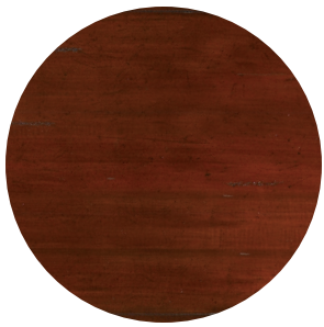
Round Maple Top Options