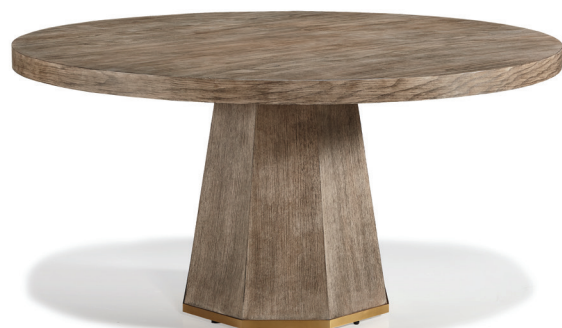
550-17 Coachella Dining Table Base ☑

227/8"W 227/8"D 29½"H Ash solids / veneers Option of Brushed Brass or Brushed Nickel Banding