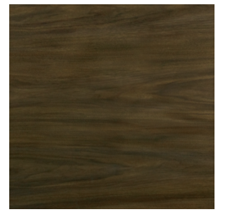
Rectangular Walnut Top Options