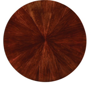
Round Walnut Fancy Face Top